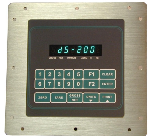
Stainless Steel SDT200-PM Panel Mount