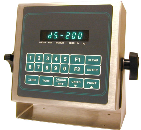
Stainless Steel SDT200 Wall Mount